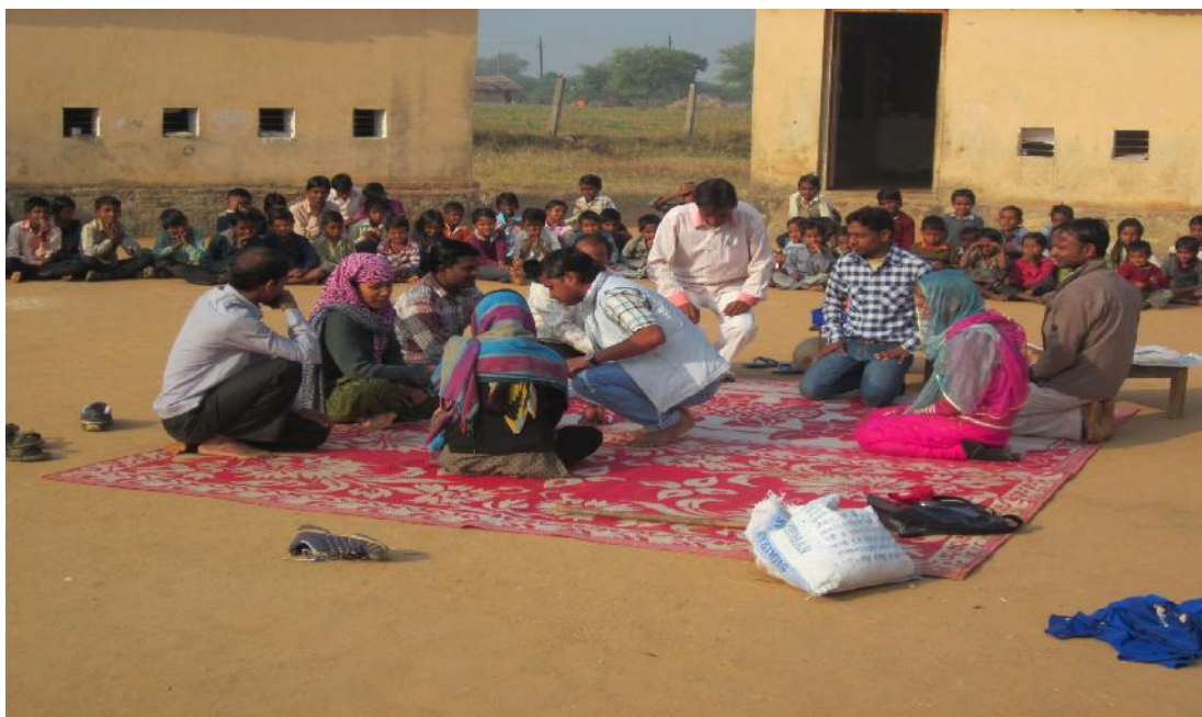
Picture: Teachers performing for children

The school this year completed its 9 th year and now has been established as a Resource School in the region. It is already supporting the communities and teachers of twenty government schools through programs like continuous support to government teachers in planning and evaluation, school management, development of libraries, teachers and head teachers training, providing fellowship for different studies to government teachers, support to the school management committee, training and exposure of mothers. The number of children in this school is 225, which is the maximum number we plan to take up. This year 26 children passed out class VIII, all of them have been admitted to the Government Secondary School at Ranwal. We are also supporting this school in our outreach program Vistaar .