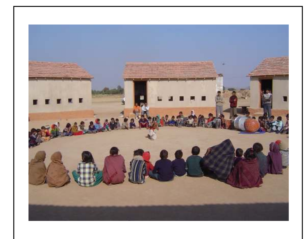
A child performing a solo play during the assembly

better financial situation/security things have changed. We expect an increase in the number of children to the school. This school now also has affiliation as an elementary school by the state elementary education board, Bikaner. Three children appeared in the Class VIII public examination. All the three students secured high first division.